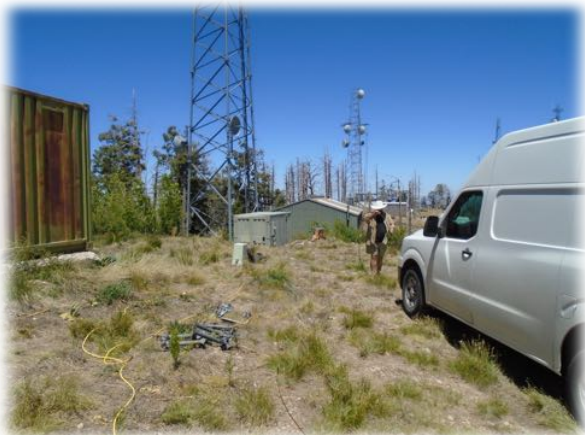
Mt Lemmon tower cleanup

Please contact Dave, N7AM, if you are interested.